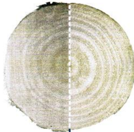
Typical Cambio Post | Typical Shaven Post Rough Surface, High Strength | Smooth Surface, Good Appearance